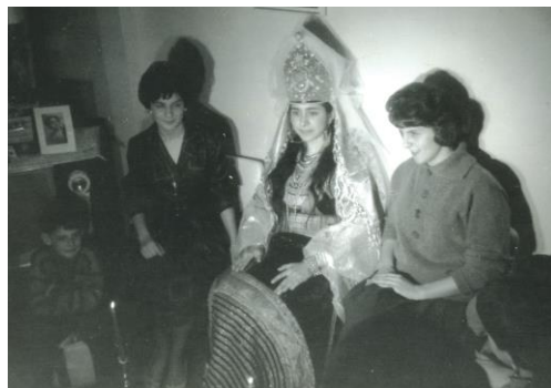
Noche de Novia Ceremony, Toronto, Dec. 1960.