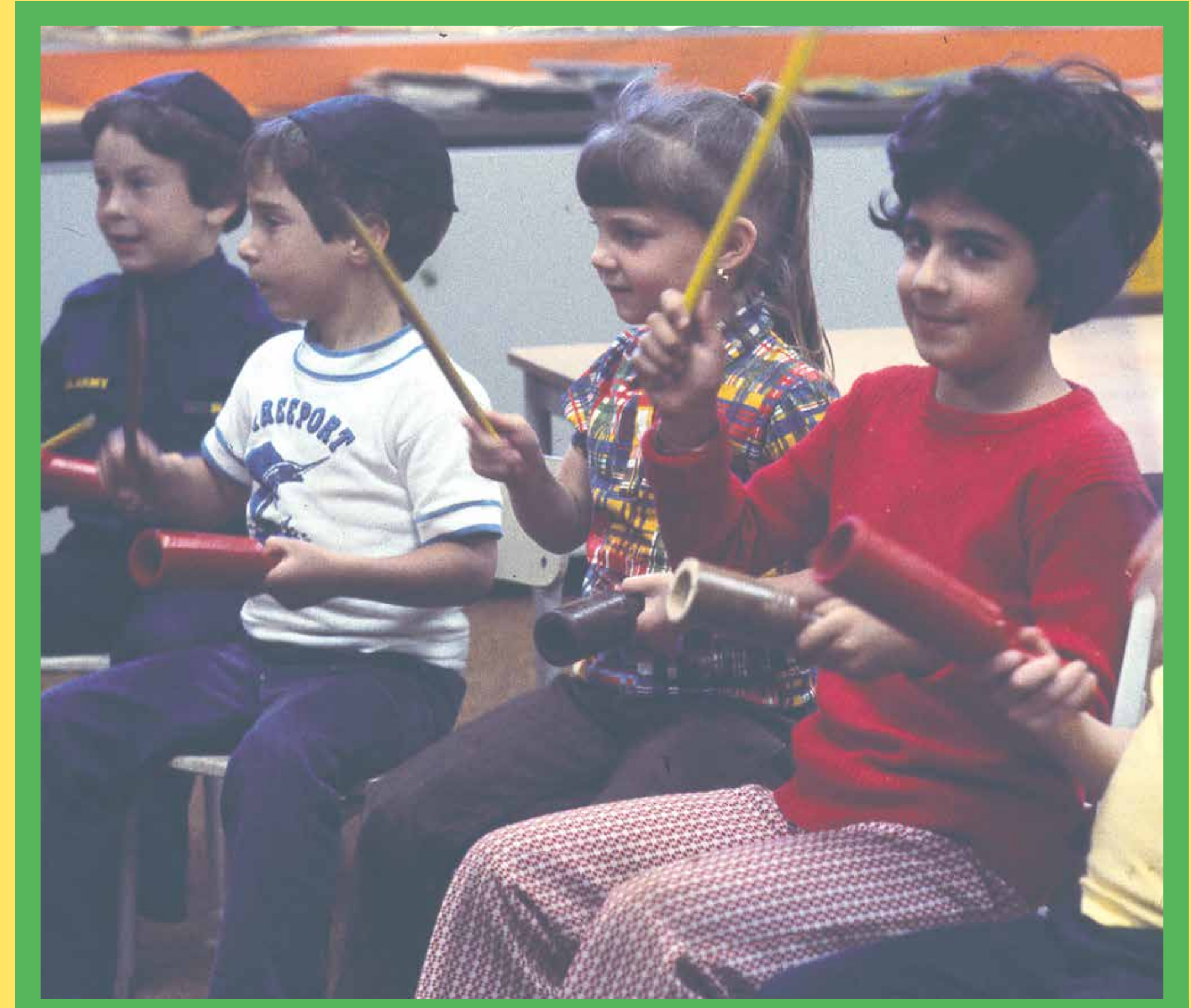
Jewish day school students playing music Toronto, ca. 1979