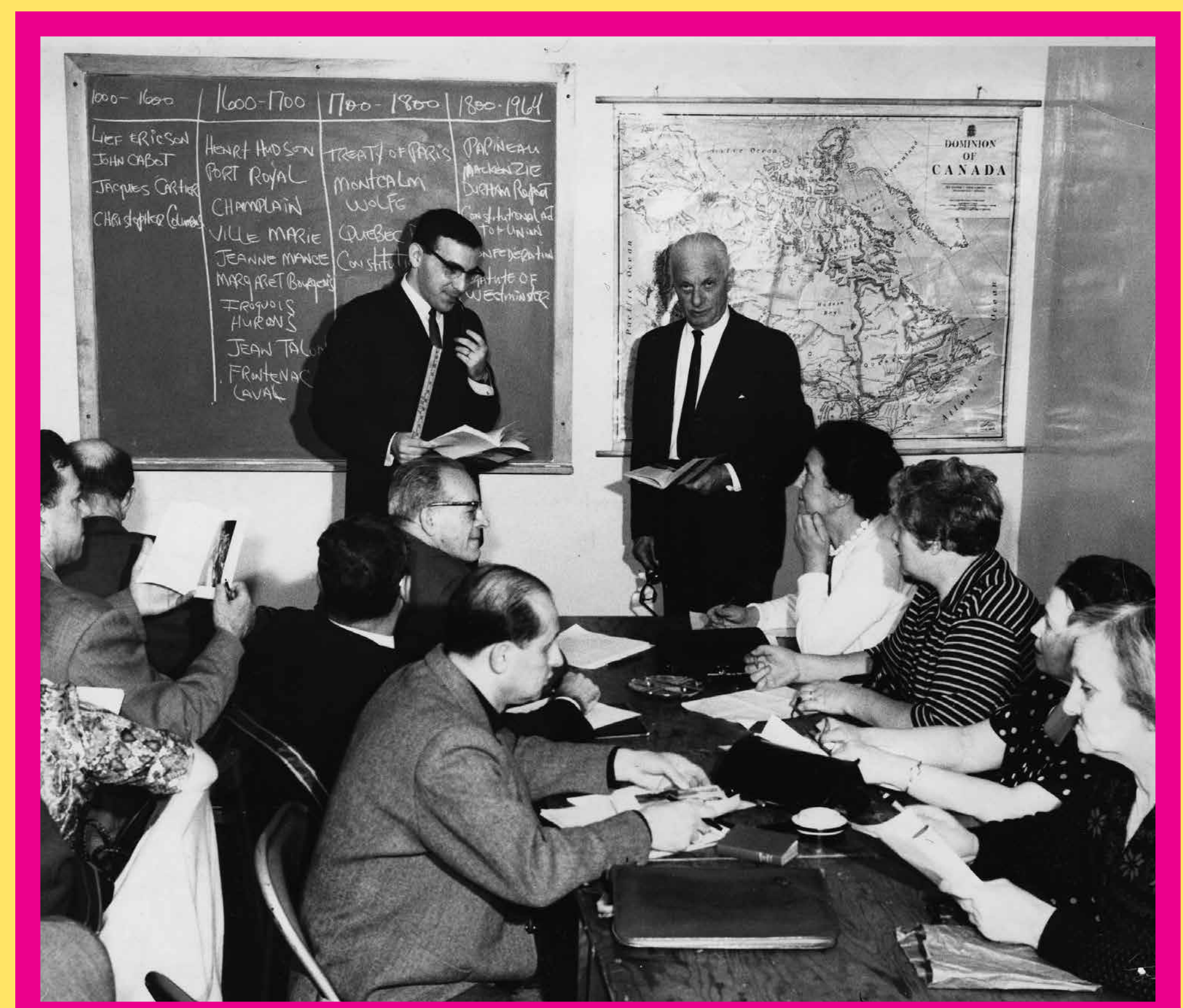
Jewish Immigrant Aid Services (JIAS) citizenship school Toronto, 1964