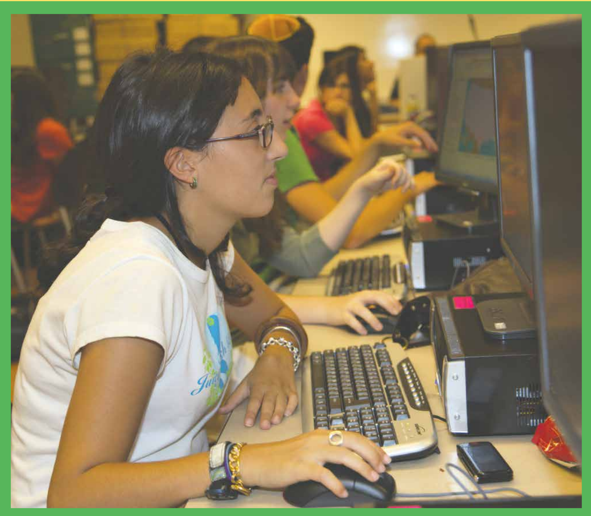
Community Hebrew Academy of Toronto (CHAT) students Toronto, 2007

Knowledge is gained through personal experience, but education teaches the experience of others. Education and learning has been the cornerstone of Jewish life in Ontario for over a century. In the beginning, one-room cheders and Talmud Torahs provided the only formal instruction for Jewish youth, but today there are a myriad of choices from after-school instruction to large Hebrew day schools. Jewish education is a major force in building vital and dynamic Jewish communities around the province.