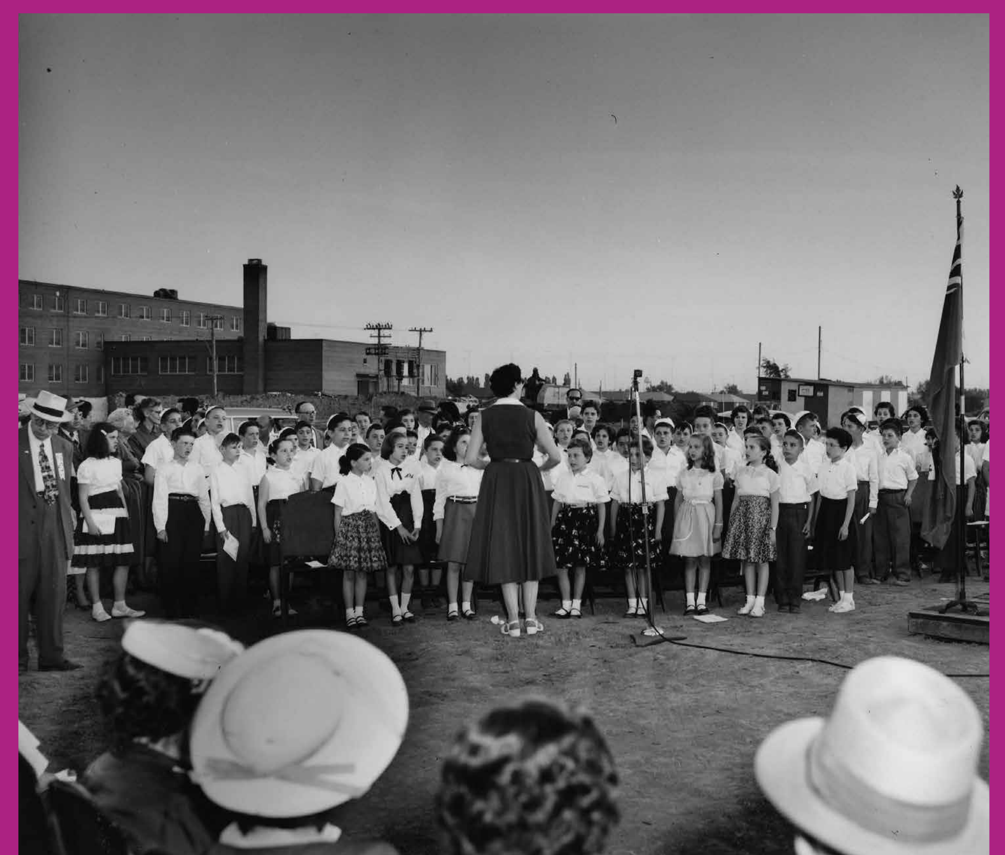
Choir at groundbreaking ceremony for Associated Hebrew School (Neptune Drive campus) Toronto, 1955 Ontario Jewish Archives, photo 2389