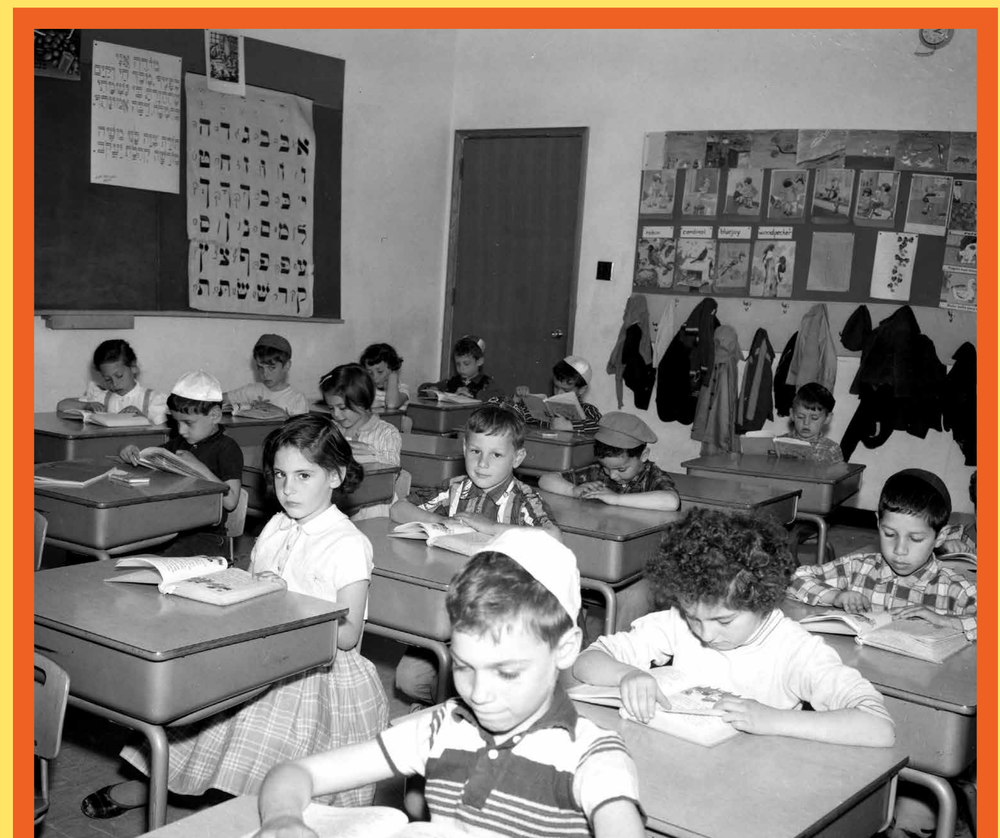
Eitz Chaim Talmud Torah class Toronto, 1958