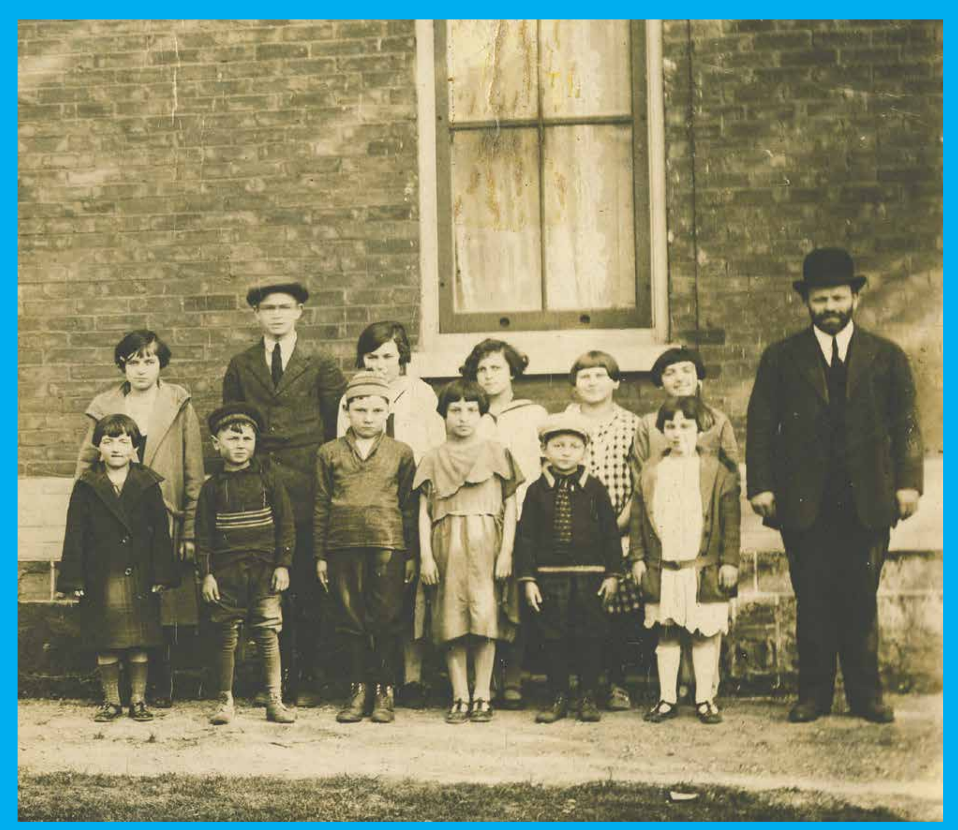
Cheder (Hebrew) class Oshawa, ca. 1925