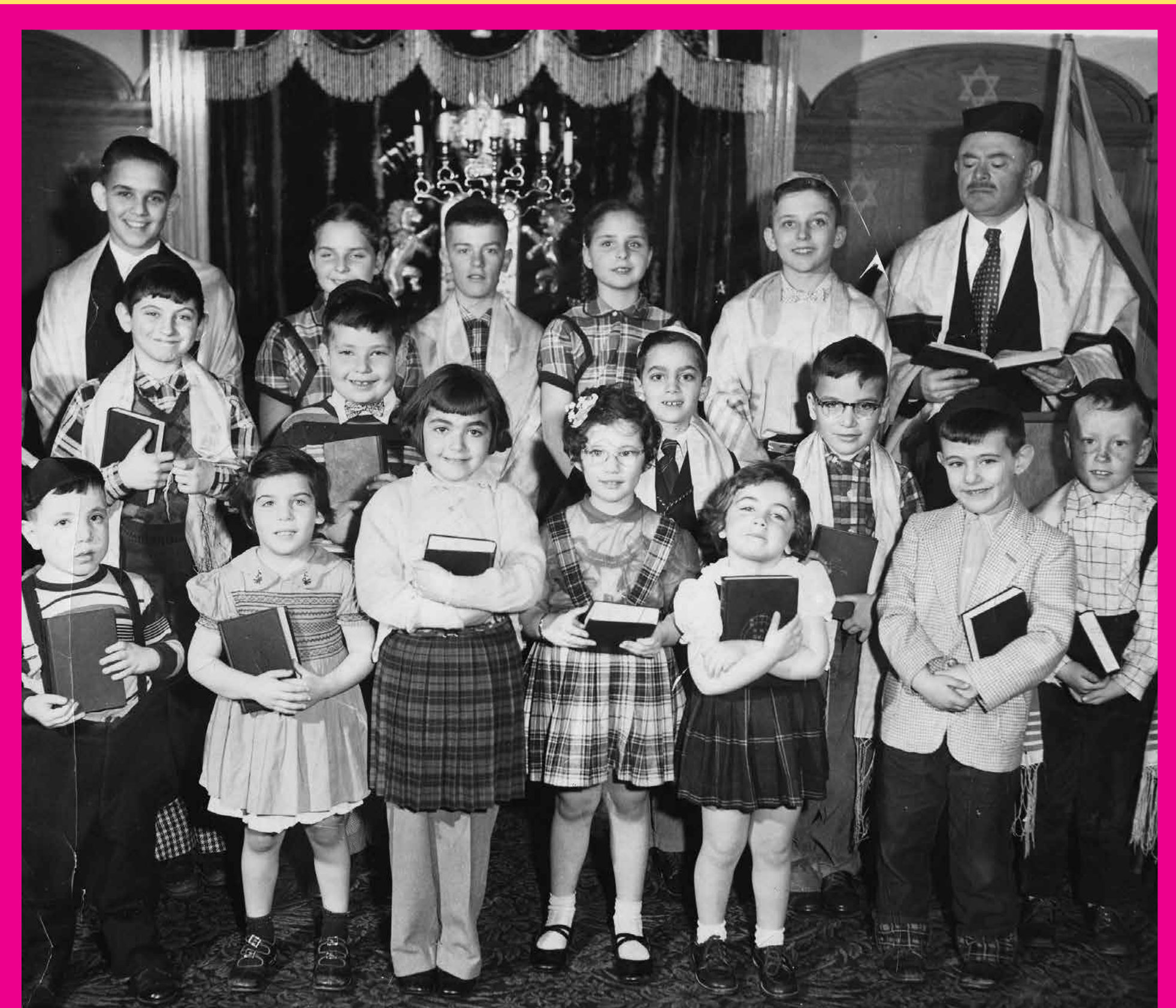
Students of Congregation Beth Jacob Talmud Torah Sault Ste. Marie, 1954